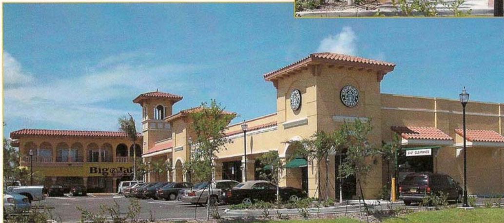
Heritage Center in Pompano Beach, Fla., received a complete facelift.

Thousands of small, mixed-use retail centers dot corners throughout the country. Many of those built in the 50s and 60s need renovation or rebuilding. Heritage Center on North Federal Highway in Pompano Beach, Fla., is a good example of what can happen to one of these older centers when a landlord, architect and contractor collaborate successfully.