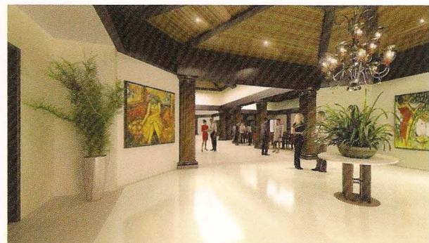
Main entry rendering

The Rolling Hills Conference Center will serve as a venue for entertaining visiting professors, and for symposiums and lectures. The community will be able to take advantage of the state-of-the-art conference center, as it will be available for weddings, meetings and similar events. The facility design features rich wood finishes, warm and inviting color schemes, marble flooring, rich fabrics and furniture that blend southern comfort with contemporary design.