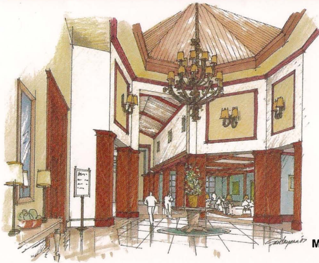
Main entry sketch